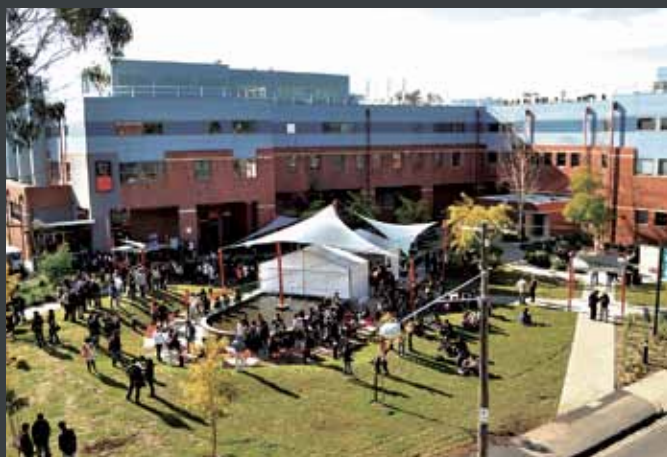
Swinburne College students and staff enjoy an end-of-year celebration lunch – one of many social activities held throughout the year.

Once you have successfully completed English for Academic Purposes to the required level and achieved other relevant entry requirements, you will have guaranteed entry to a wide range of certificate, diploma, bachelor, master and higher research degree courses at Swinburne.